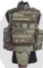
Bullet Proof Jacket