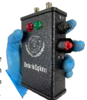
Electronic Exploder Shrike-I

EI-577 is an electronic explosion device which is designed to provide high potential difference required to activate electrically initiated carts/dets.