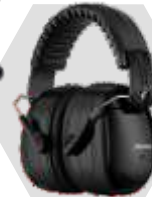
Noise Reduction Ear Muffs