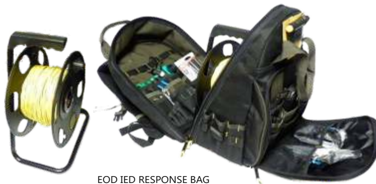
EOD IED RESPONSE BAG