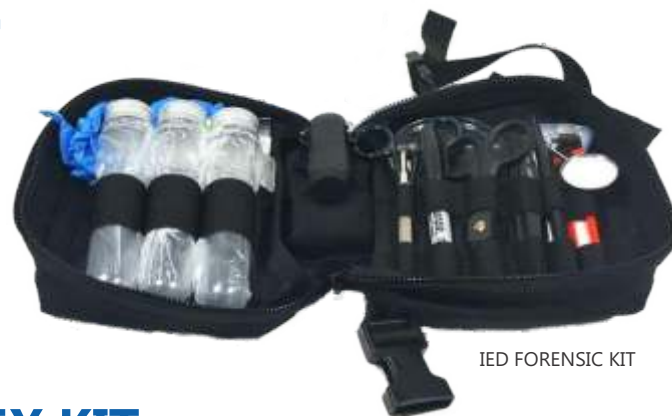
IED FORENSIC KIT

NRTC IED Tool kit is loaded with 20x professional tools to enhance the Bomb Disposal Squad's ability of post blast forensic investigation. Customization is available as per user requirements.