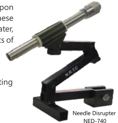
Needle Disrupter NED-740

NED-740 is typically used to disrupt letter or small parcel devices, resulting in high probability of avoiding detonation of suspected devices.