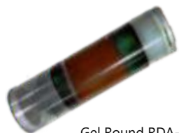
Gel Round RDA-003