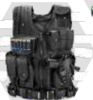
Load Bearing Jacket