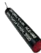
Sound Unit Needle NLE-095