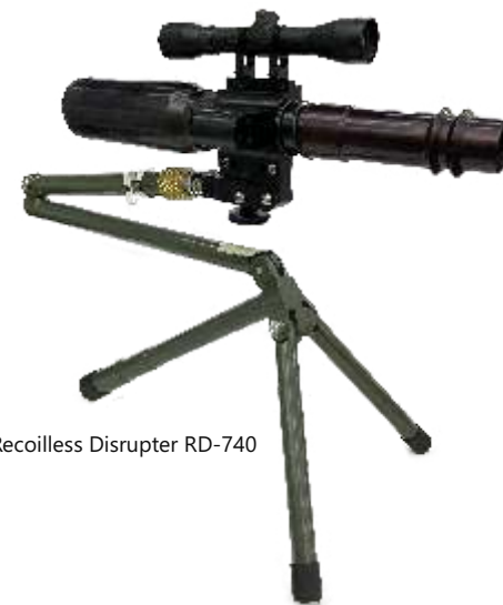
Recoilless Disrupter RD-740