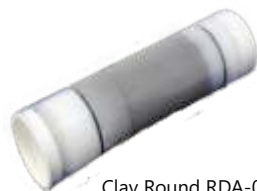
Clay Round RDA-002