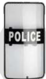
Anti Riot Shield