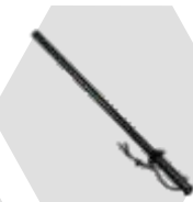
Anti Riot Baton