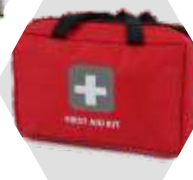
Team Medic Bag