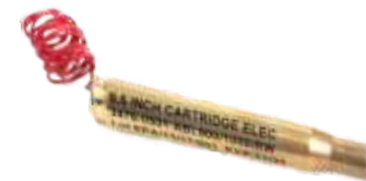
SGH Round RD-161