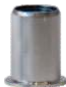
Ammo Cart for Hotrod HOT-008