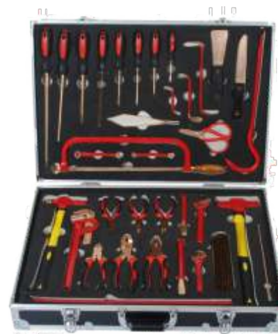
Non-Magnetic Tool Kit

Designed with the ultimate protection and safety in mind, our Non-Magnetic Non-Sparking tool kit is built for EOD Technicians working on or near magnetic equipment or in highly flammable work environments.