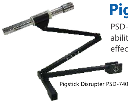
Pigstick Disrupter PSD-740

PSD-740 is specially designed to disrupt wide range of explosive devices. It has the ability to pierce through a metallic sheet of 1.5mm thickness, enabling its effectiveness against suspected trunks, baggage's etc.