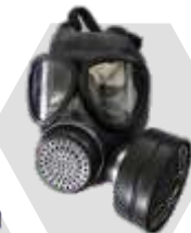
Gas Mask Respirator