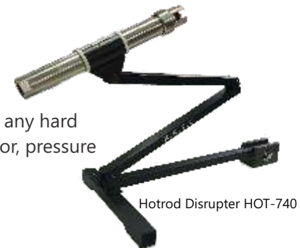
Hotrod Disrupter HOT-740

Hot-740 is the most powerful disrupter tool against any hard cased threats. It has the ability to disrupt vehicle door, pressure cooker, metallic sheet of thickness 3.2mm.