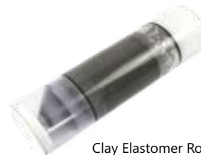
Clay Elastomer Round with Penetrator RDA-001