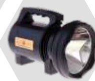
Handheld Spot Light