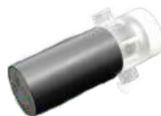
Flip Fin Clay Round RDA-094