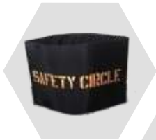
Bomb Safety Circle