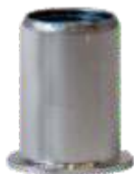
Ammo Cart for Pigstick PIG-006