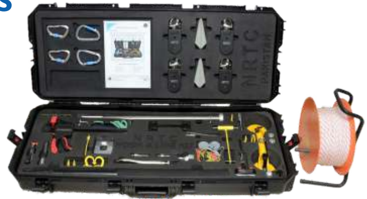
NRTC HOOK & LINE KIT