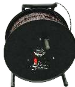
EI Cable EI-513

EI-513 is a twisted cable of 250 meter on a spool. It is used to provide safe distance interface between exploder and disrupter