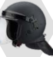
Anti Riot Helmet