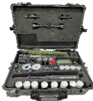
ABS CASE FOR RD-740

The key feature of the RD-740 is that it is completely recoilless in operation using an annular compensating water mass ejected from the rear to neutralize the recoil. It has the ability to provide max standoff distance of 5-30 meter from target, ensuring effective piercing.